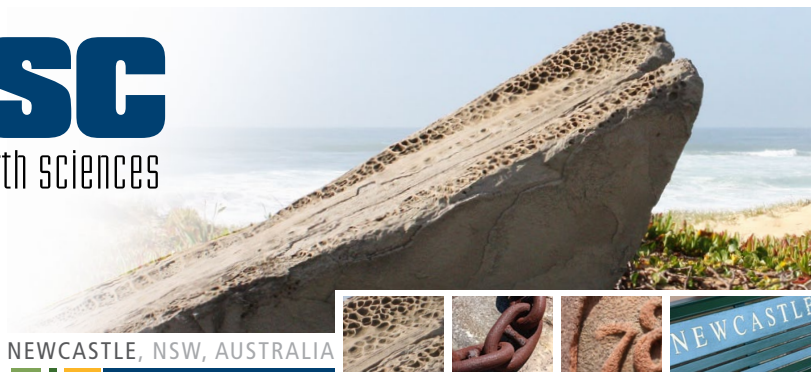
NEWCASTLE, NSW, AUSTRALIA