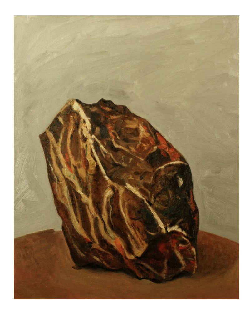
Gneiss 2015 oil on canvas, 51 x 40.5 cm

Besides the oil paintings of rocks, the exhibition features a series of gouache landscapes painted in front of the motif, including the gibber plains of South Australia.